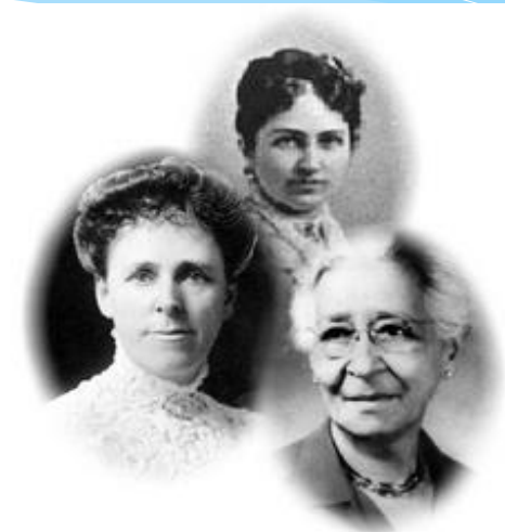
Alice McLellen Birney, Phoebe Apperson Hearst and Selena Sloan Butler.