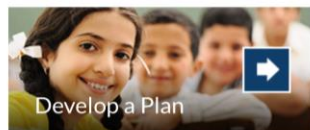
Develop a Plan

National PTA Programs aim to bring families together at school to build relationships and support student success, all while enriching children's education and overall well-being.