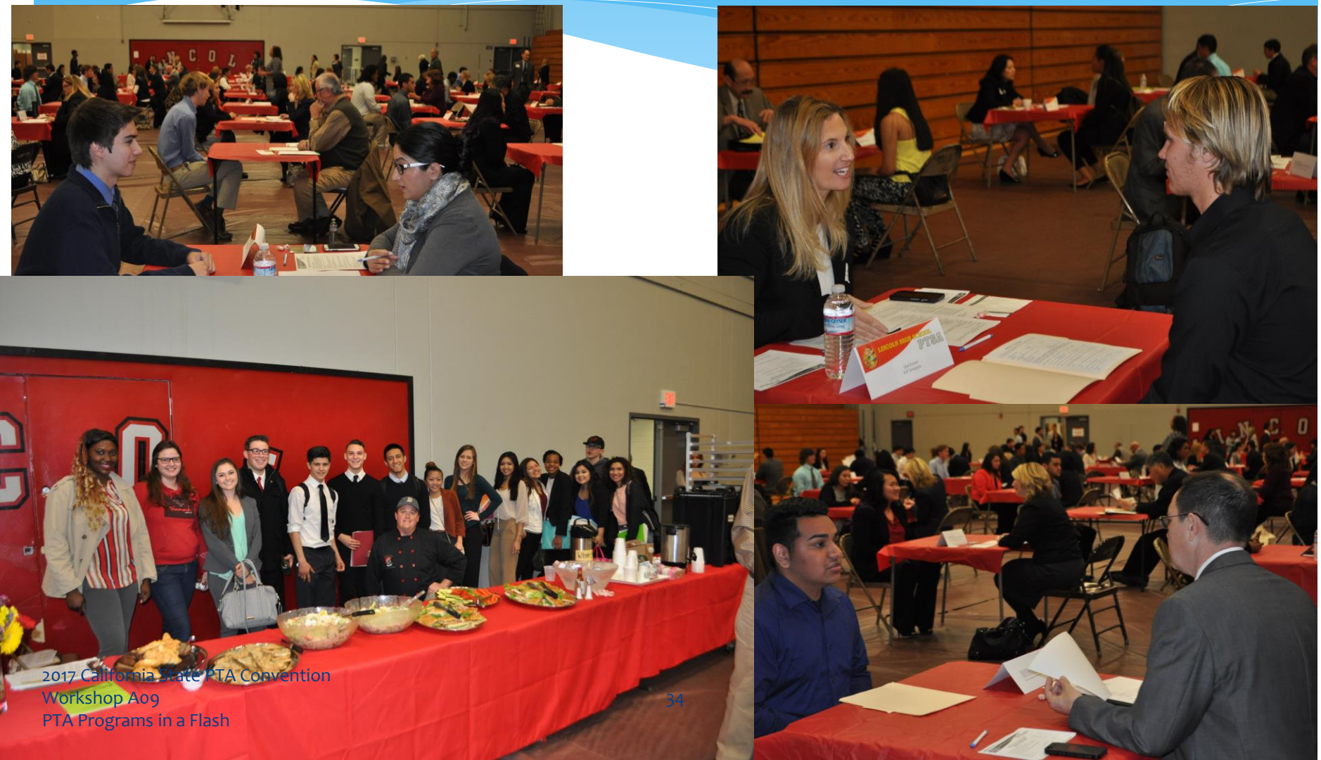
2017 California State PTA Convention Workshop A09 PTA Programs in a Flash