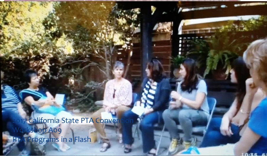
2017 California State PTA Convention Workshop A09 PTA Programs in a Flash